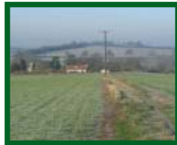
View towards Hampton from Highworth Cemetery