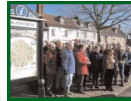
Market Square in Highworth