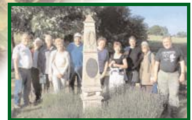
Ian Fleming's final resting place, in Sevenhampton Churchyard