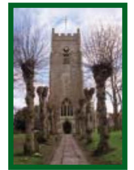
St. Michael's Church Highworth as seen from Lechlade Road