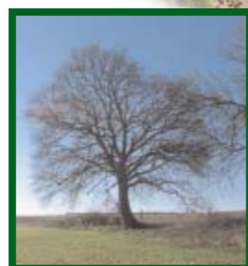
Oak tree near wind pump