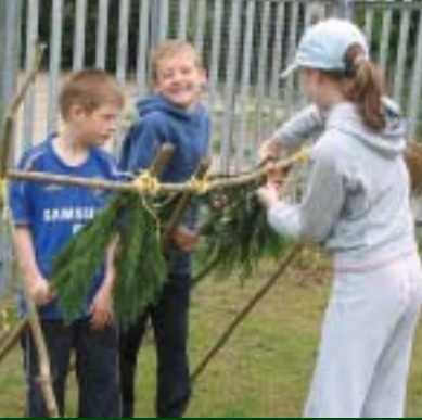
Den Building, June 2006