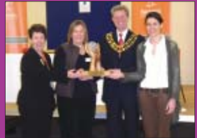
Winners of the 2006 Quality of Life Award Trophy

Every year the Sustainable Development hosts the Quality of Life Awards and Eco-Bash to promote sustainable lifestyles. If you know of a group or are carrying out a project that improves the environment and / or quality of life awards then why not apply. Winners of each category can receive up to £500, a certificate and plaque. The overall winner will receive the Quality of Life Award Trophy for a year.