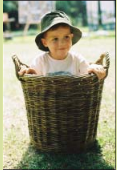
'Basket making at Forest Festival 2005!'

Since 1999, this FREE one day event has provided a packed programme of musicians and performers, children's workshops, woodcraft demonstrations, displays and local organic food. Its unique 'access for all' philosophy means literally everyone can come and join in – absolutely free!