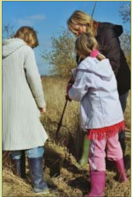
Shaw Community Tree Plant, March 2006

Planned activities include a hidden animal scavenger hunt, willow halo and dream catcher making, bird feeder making, leaf rubbing, collage making, den building, coppicing, a small amount of tree planting, walking stick making, guided walks and pole lathe turning.