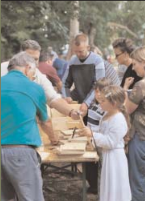
Nest Box Making

All materials will be provided and light refreshments will also be available. There will be plenty of displays and information from our partner organisations too.